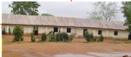
Silanga School, Kenya